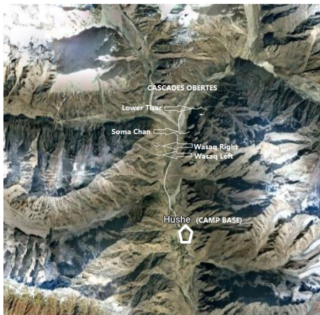
Map of climbs completed by a Spanish group in February 2024.