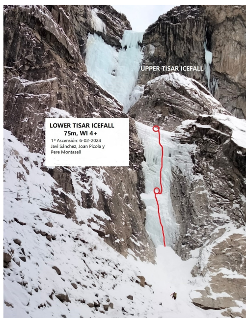
Topo for Lower Tisar, north of Hushe.