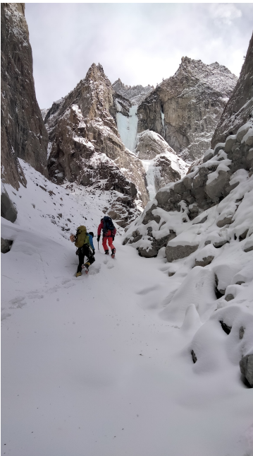
Spanish climbers approaching the Tisar falls near Hushe village. The lower tier was climbed in February 2024.