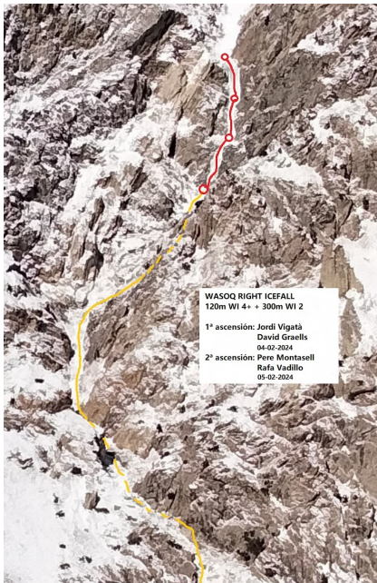
The line of Wasoq Right, near Hushe village.