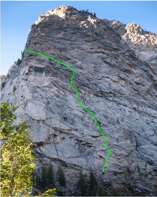
Chilly Dogs (5.10- PG-13, III 1,000'), on the south face of Storm Point, adds six new pitches above the single-pitch Hot Dogs (5.9).