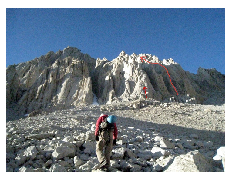
Felsic High Road (1,500', III 5.8)—the right-hand of the two marked lines—on the north face of Mt. Langley, Sierra Nevada, California. The arrow shows the start of Horizontal Thought Movement (Cohen-Ricklin, 2009).