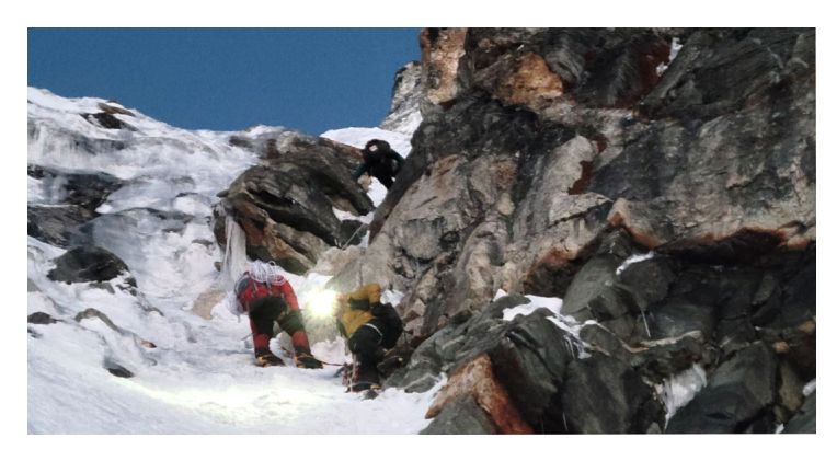
Negotiating the couloir that forms the main part of the 2024 ascent on the east-southeast face of Jugal I.