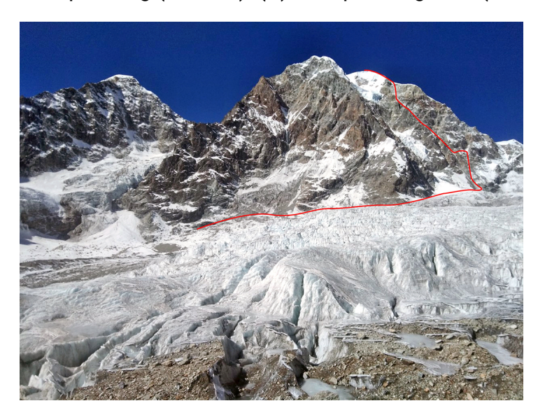
The 2024 Korean-Nepalese Route followed a slender couloir on the east-southeast face of Jugal I (6,591m). The rocky summit toward the left edge of the picture is Jugal III (6,184m).

Seen across the Jugal Glacier from Phurbi Chhyachu: (A) Dorje Lhakpa (6,966m). (B) Jugal I south top (ca 6,510m, unclimbed). (C) Jugal I (6,591m). The 2024 first ascent by the east-southeast face, following a slender couloir through the rock, is marked. Behind and almost obscured by Jugal I is Leonpo Gang (6,979m). (D) Leonpo Gang East (6,733m). Jugal II (6,518m) is hidden north of Jugal I.