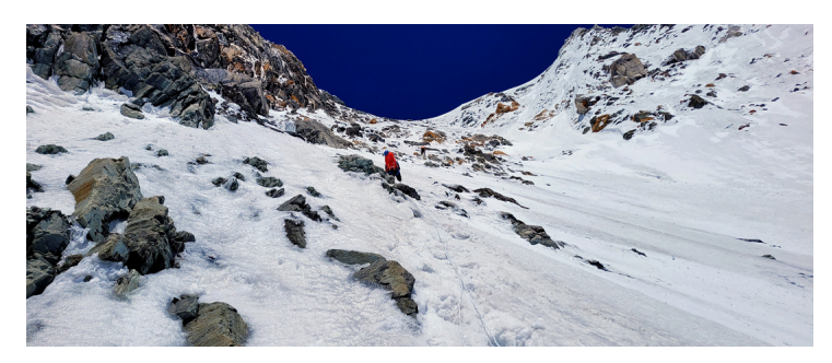
On the lower section of the east-southeast face of Jugal I.