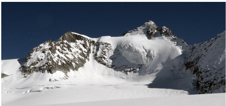
The unclimbed northwest face of Kajin Sara (5,772m).