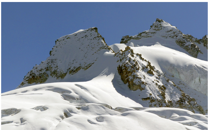
Seen from the glacier to the north-northwest are Chautari (left) and Kajin Sara.