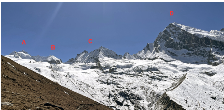
The middle section of the Kajin Sara seen from the north. (A) Kajin Sara. (B) Peak ca 5,600m. (C) Samaya Himal. (D) Chame East.