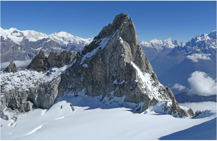
Karma Himal from the west. The Devil's Ridge is to the left and the isolated tower at far left is the Dema Hat.