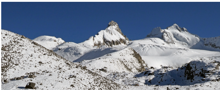
Kumari Peak (center) and Kajin Sara (right) from the north-northwest.