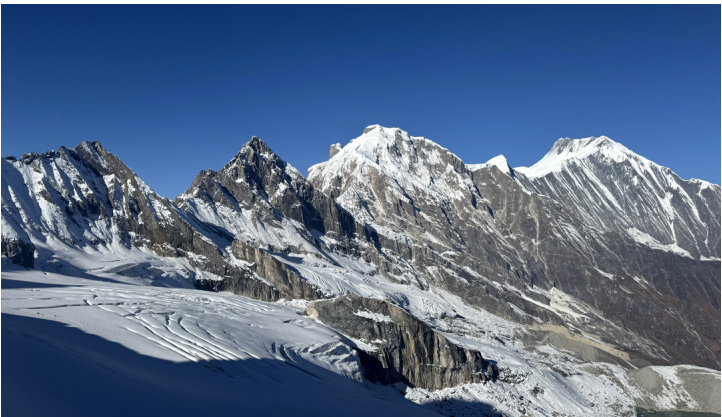
Seen from the east, from left to right: the southern top of Samaya Himal, Chame East, Lamjung Himal, unnamed peak, and Annapurna II.