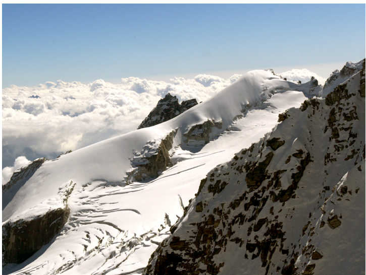
Namun Bhanjyang seen from the west.