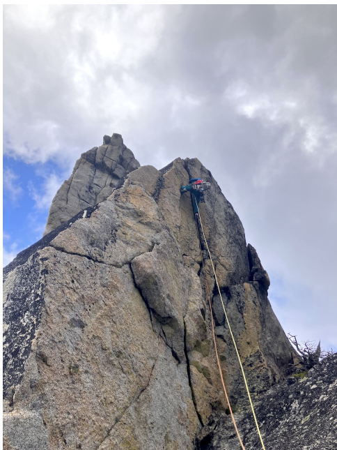
Wayne Wallace on the final pitch, a 5.10c hand crack, on Song of the Summer.