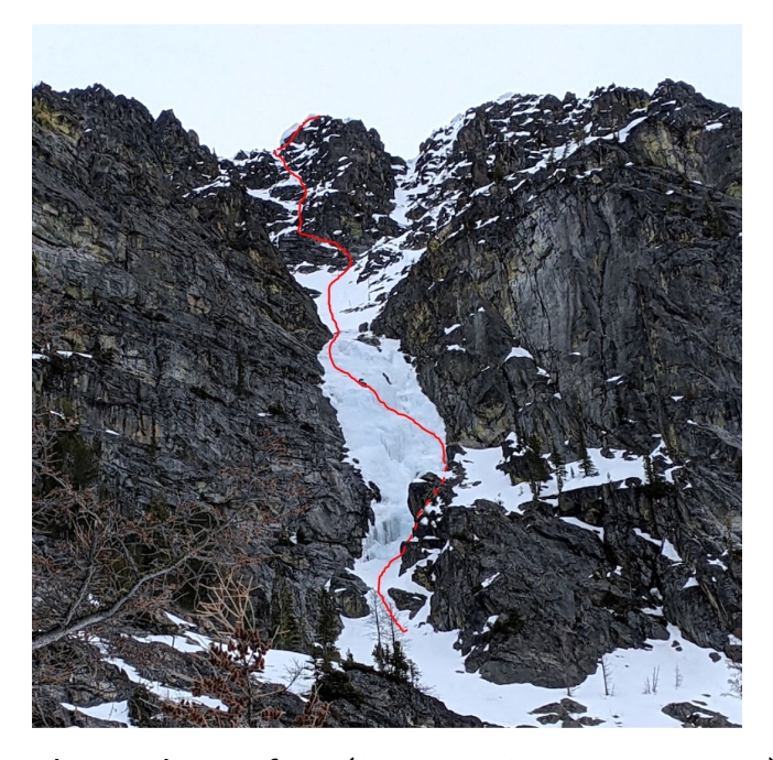
The northwest face (300m, WI3 M3 steep snow), Choral Peak, Entiat Mountains, North Cascades, Washington.