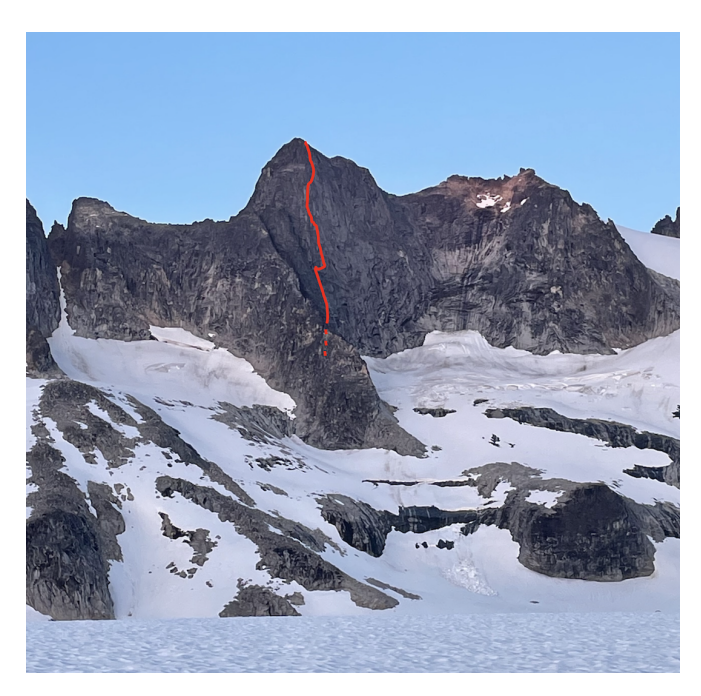
Worth the Jaunt (300m, Alaska Grade III, 5.10), the first ascent of Organa Pipette on the Juneau Icefield.