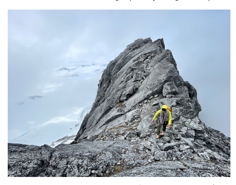
Vincent LaPointe on the top of Organa Pipette (Peak 5,660') after making the first ascent with