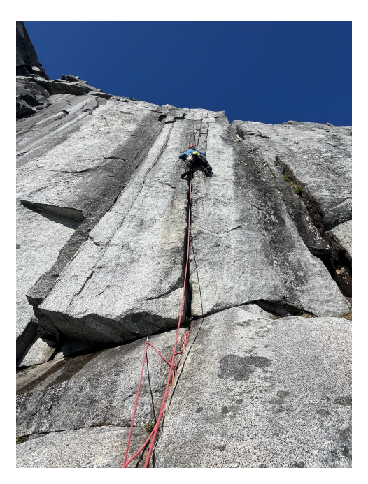
Sam Cohen climbing the splitter hand crack on Inside Passage's final headwall pitch.