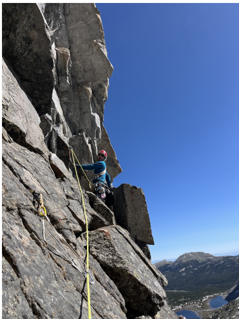
Damien Nicodemi on the key traverse on pitch four (5.9) of Big Chiefin' (1,100', 9 pitches, IV 5.11 C1).