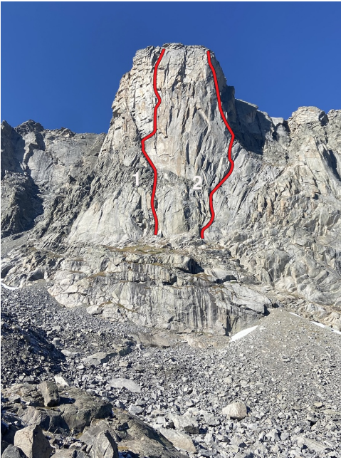
The east-facing Big Chief Buttress in the Washakie Lake Cirque, showing (1) Big Chiefin' (2024) and (2) the approximate line of The Non- Obvious Garden Tour (2016).