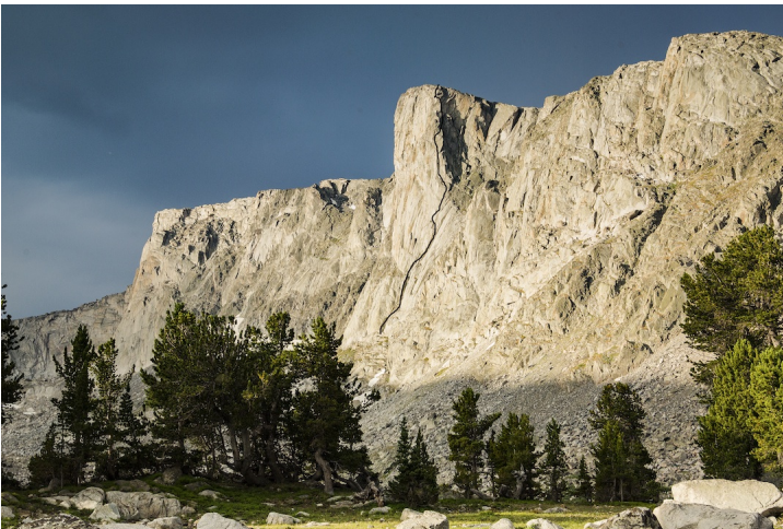
Big Chief Buttress in the Washakie Lake Cirque. The line of The Non-Obvious Garden Tour (2016) is shown. The 2024 route, Big Chiefin', is in the left center of the face.