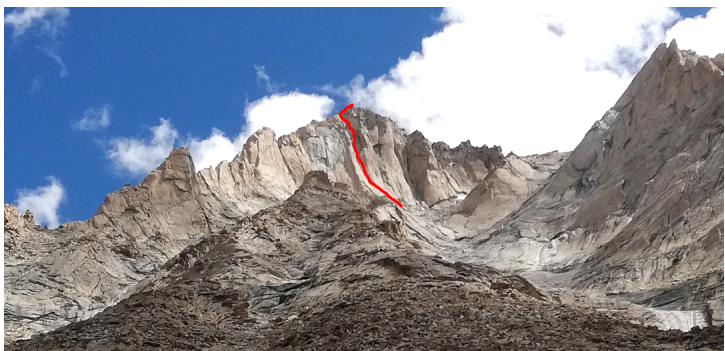
The southwest face of Shafat Peak and line of La Gent que Estimo. Earlier in the summer, a different line called Tukcheche was climbed farther left on the same pillar. Both routes gained about 500 meters.