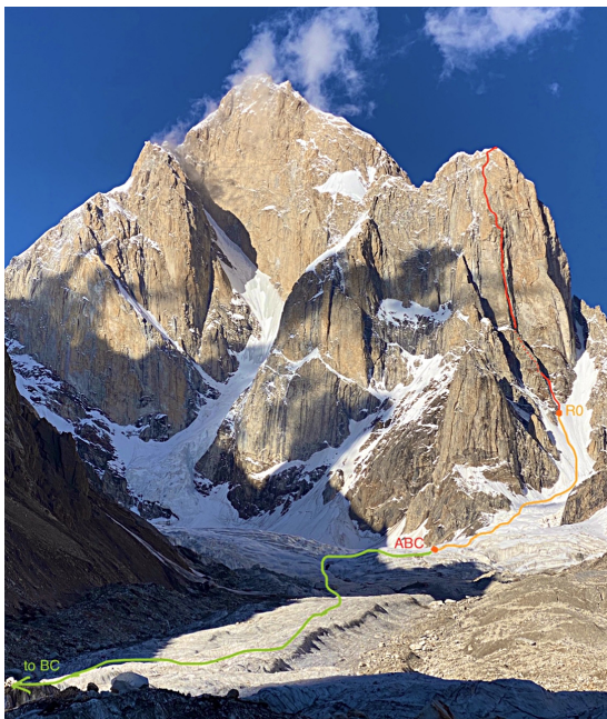
The southwest face of Latok II, showing the 2023 route on Latok Thumb (6,380m). The first ascent of Latok II, in 1977, began on the southeast spur (hidden behind Latok II) and finished on the south-southwest ridge (right skyline). See AAJ 2013 for other route lines on this face.