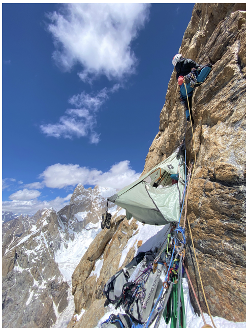
Climbing above the portaledge Camp 2 at 6,030m (Pitch 20, 6b).