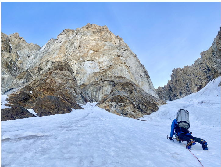
Miquel Mas climbing the approach couloir in early morning, with the southwest face of Latok Thumb above. This image was taken during the 2022 attempt.