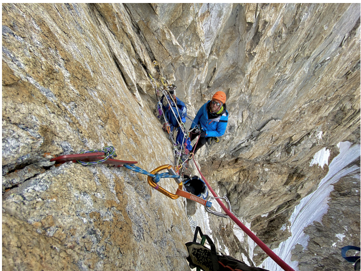
Miquel Mas on belay at the start of pitch eight (A2+) on the first ascent of Latok Thumb.