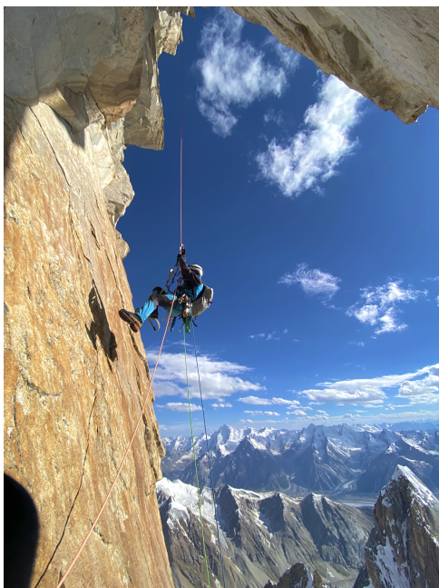
Miquel Mas surmounting the big roofs of pitch 17 (6a A2), the steepest section of the southwest face of Latok Thumb.