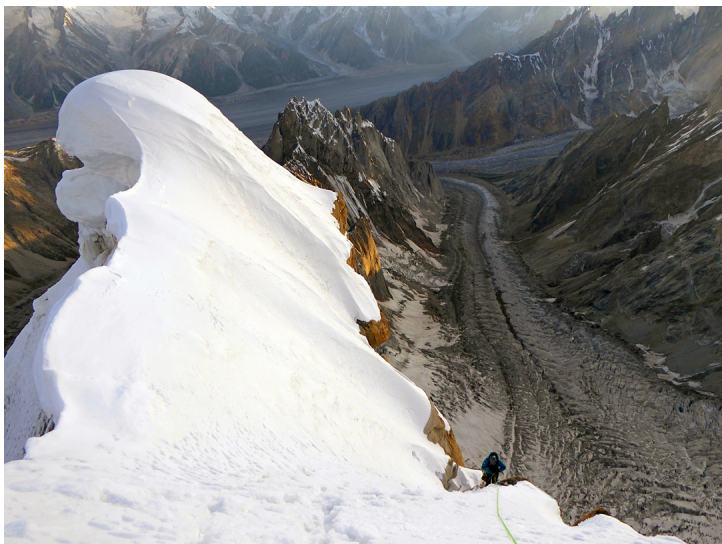
Nearing the summit of Latok Thumb with the Latok Glacier below and the Biafo Glacier in the far distance.