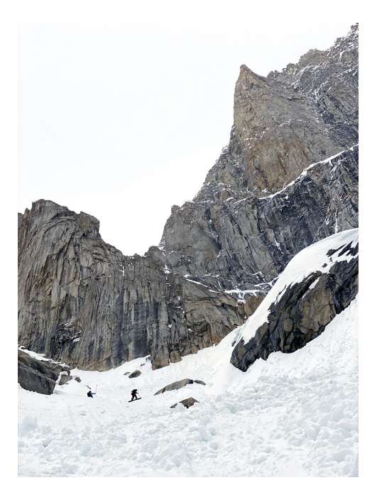
Skiing and snowboarding in the couloir north of Nuating III.