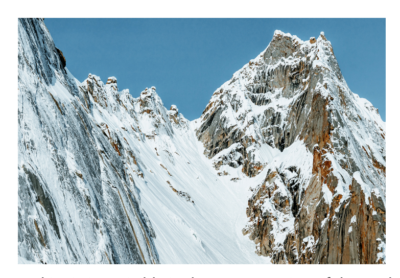
A skier is just visible in the upper section of the couloir north of Peak 5,597m.