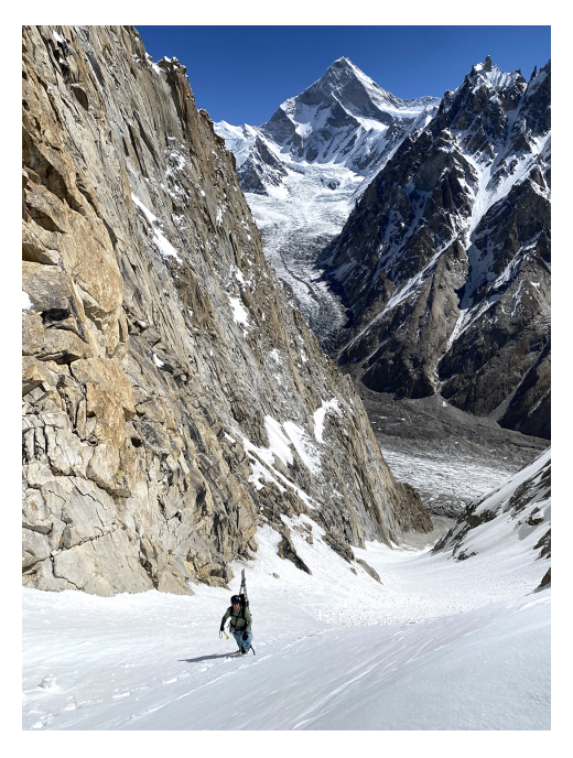
Ascending the Lobsang Couloir prior to a ski descent. In the background is the southwest face of Muztagh Tower.