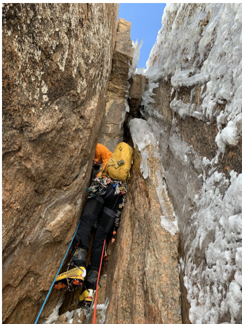
During the attempt on a new route on "Pik Zabor."