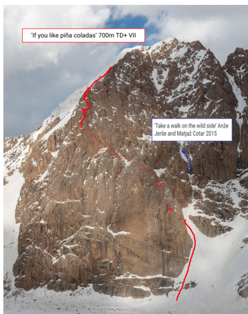
The line of the incomplete route If You Like Piña Coladas on the southwest side of Pik Gronky.