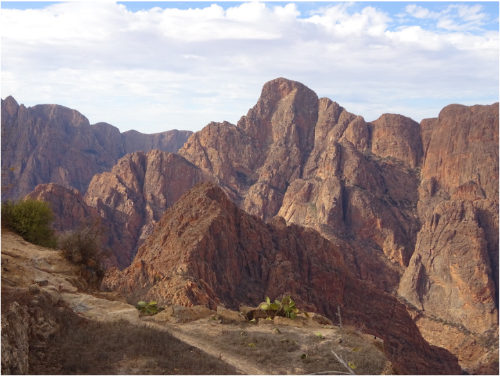
The south side of Adad Medni. The full face is about 1,000 meters high.