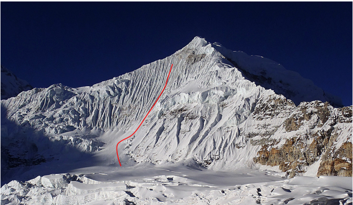
The northeast face of Anidesh Chuli and the line attempted by a Japanese team in 2023.