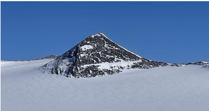
The Shark's Fin from the east. The route of ascent was the right skyline. The team continued along the left skyline to climb "Moby Dick."