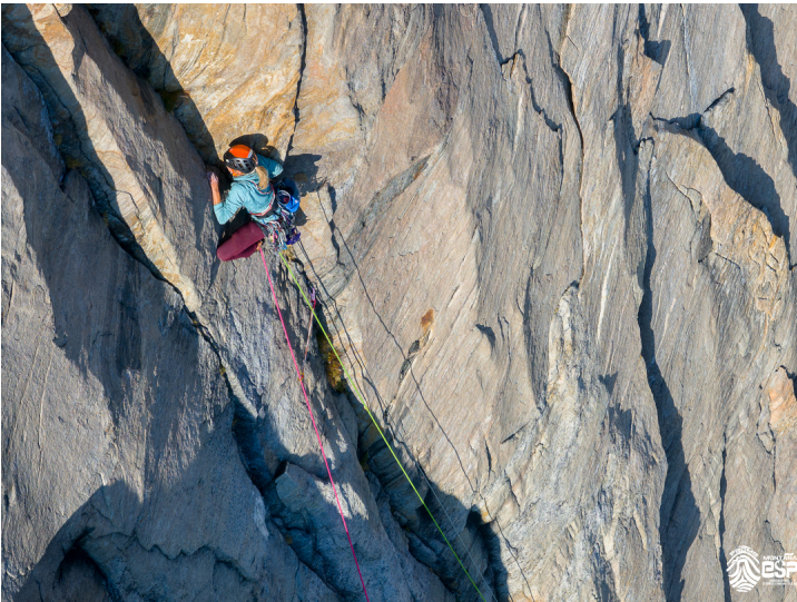
Julia Casanovas climbing on the northeast face of Ataatap during the link up of three routes.