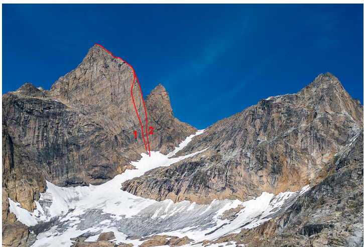
The south side of the Hidden Tower with approximate lines of Fumantxus and Assembling the Tupilak.