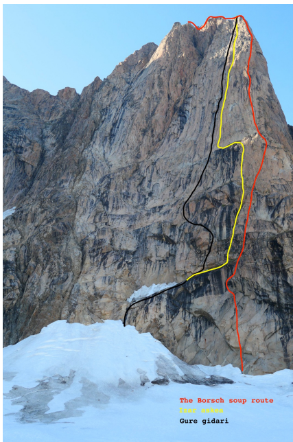
Borsch Tower and the three established routes: from left to right, Gure Gidari, Izar Askea, and Borsch Soup