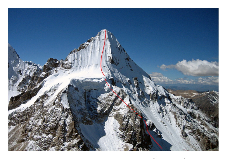
Fu Yao on the north and northeast faces of Xiao Gongga. The right skyline is the northwest ridge. The original ascent in 1981 took a gully just beyond the left skyline.