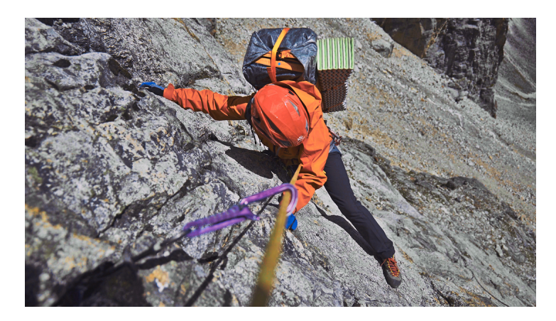
On the south spur of Yinhaizi during the first ascent.