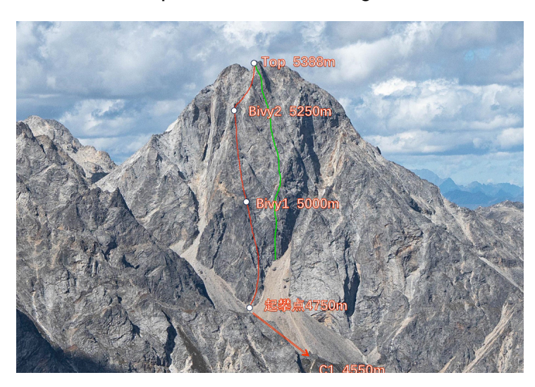
Yinhaizi from the southeast, showing the route of the first ascent via the south spur. The green line marks the descent. The highest summit on the left is Peak 5,268m.