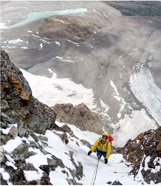
Climbing on the north face of Turgun.