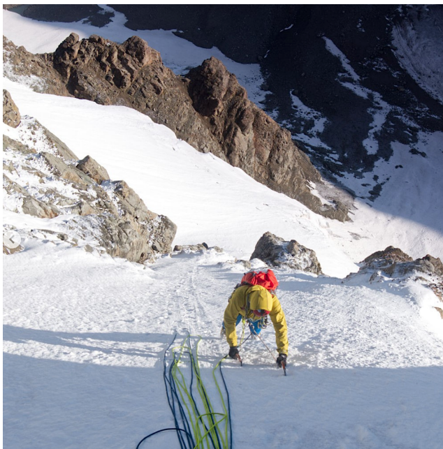
During the first ascent of the north face of Turgun.