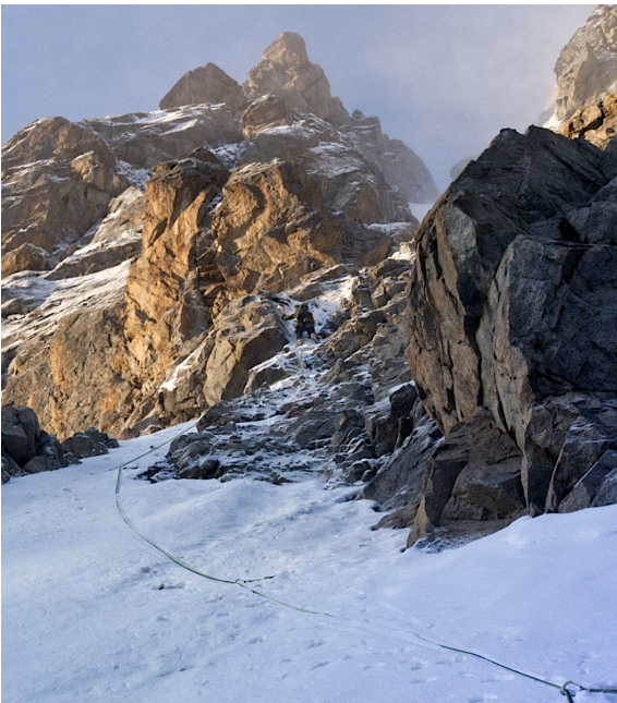
Climbing on the north face of Turgun (4,410m).