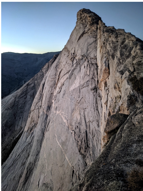
Looking north at Bearpaw Dome from the south shoulder of the wall.