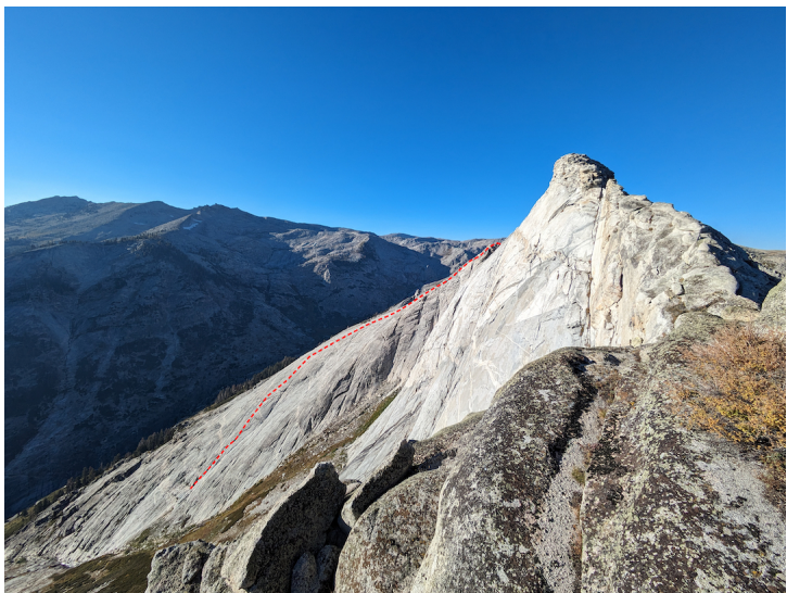
Long Distance Runner (2,800', 5.8+) on Bearpaw Dome, Sequoia National Park, Sierra Nevada, California.