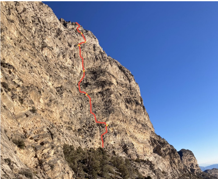
View of the main pitches on The Allotrope (900', 7 pitches, IV 5.10- R) on the south face of La Madre, La Madre Mountain Wilderness, Nevada.