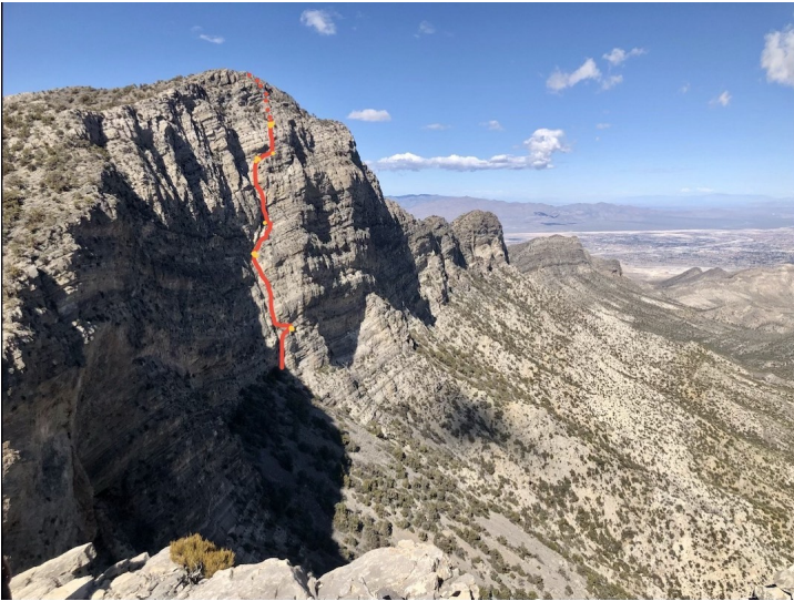
The Allotrope (900', 7 pitches, IV 5.10- R) on the south face of La Madre, La Madre Mountain Wilderness, Nevada.