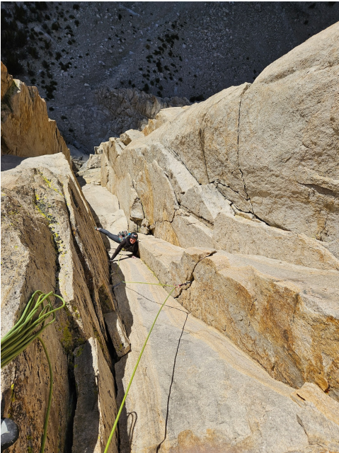
Trish Matheny climbs pitch four (5.10b) on Wonder Woman.