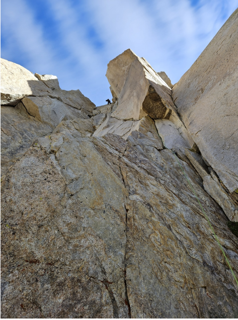
Trish Matheny near the top of pitch two (5.11c) during the first ascent of Wonder Woman (700', 5 pitches, III 5.11c).