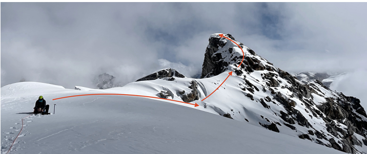
Thoda Peak (5,604m) and the 2023 route of ascent up the west ridge.