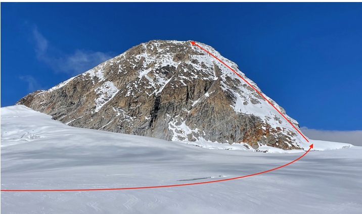
Sara Peak (5,878m) and the 2023 route of ascent up the northeast ridge.