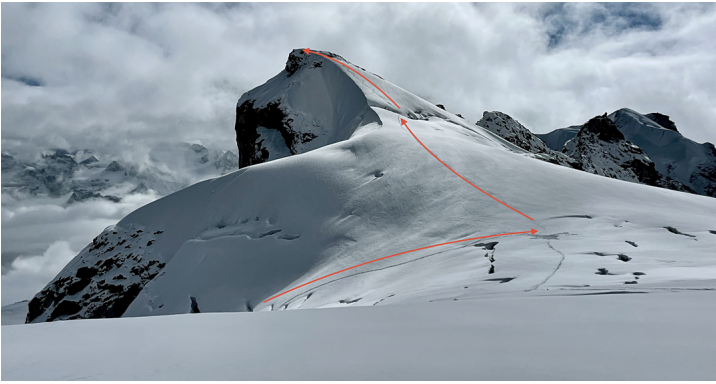
Dhairya Peak (5,543m) and the 2023 route of ascent up the southwest face.