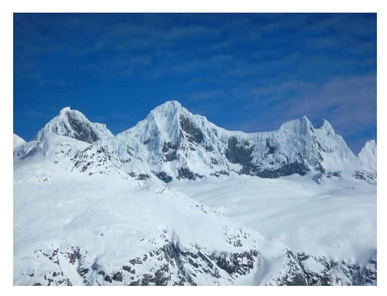
The Mendenhall Towers from the south. The Main Tower (6,910') is in left center.