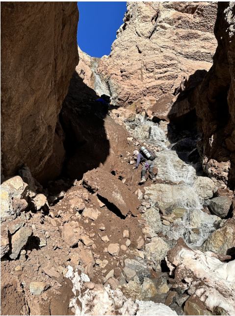
A "special" flavor of Andean approach: rock, mud, and cascades.