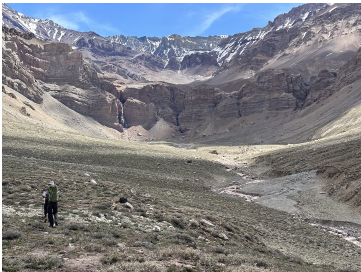
The 300-meter cliff at the end of the Quebrada Potrero Escondido.