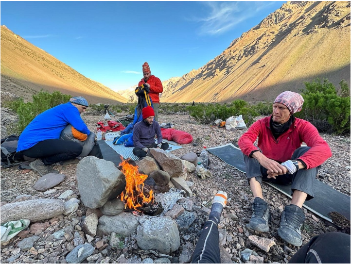
Camp at the entrance of the Quebrada Potrero Escondido.