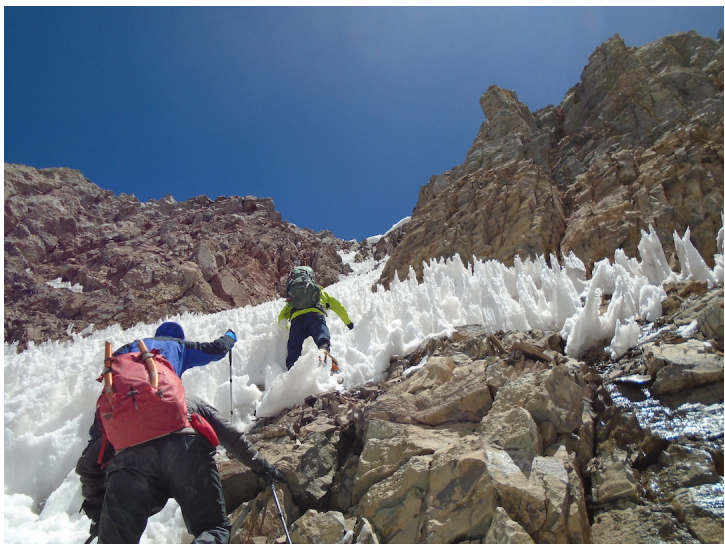
The joys of nieves penitentes in the steep couloir near the top of Cuchilla Negra's east face.