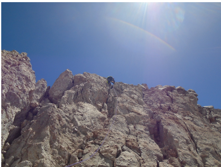
Climbing rock (UIAA III) to the summit of Cuchilla Negra (5,130m).