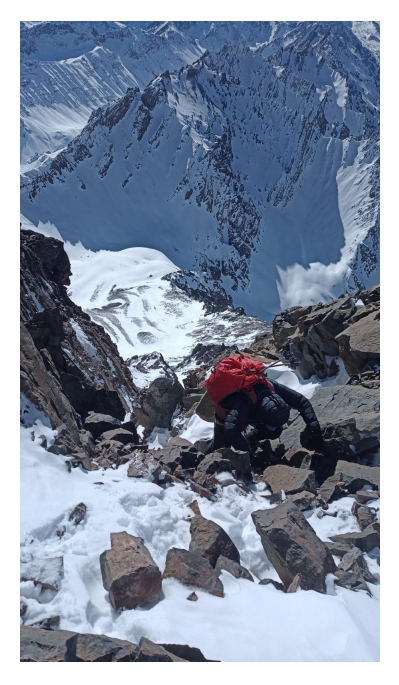
Nearing the top of Cerro Tres Hermanos (4,751m) on the north face.