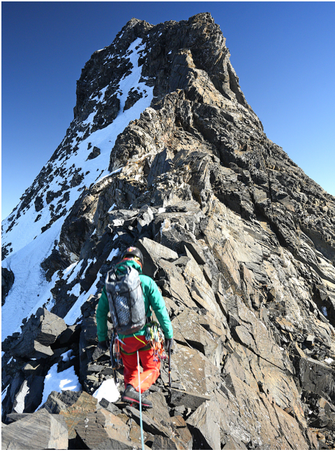
On the upper west ridge of Peak 5,324m.