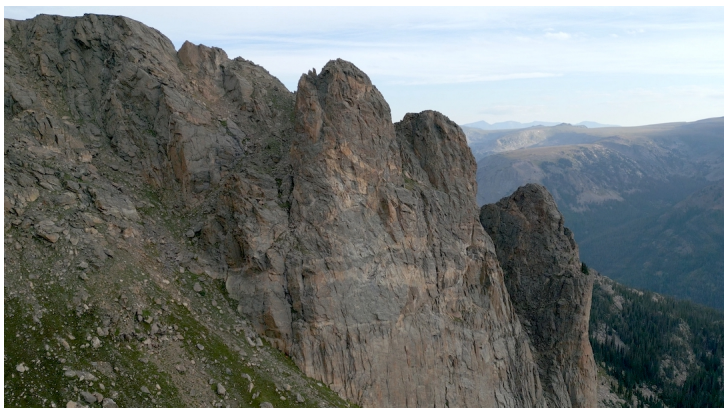
Another view of Tower Five in the Ptarmigan Towers, showing the potential on its crack-lined walls.