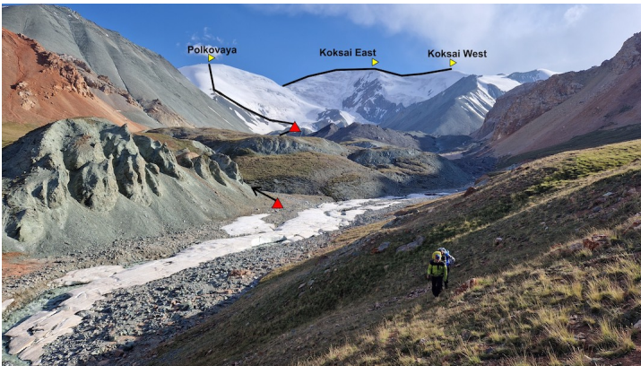
Route followed for the ascents of Piks Polkovaya and Koksai East and West.