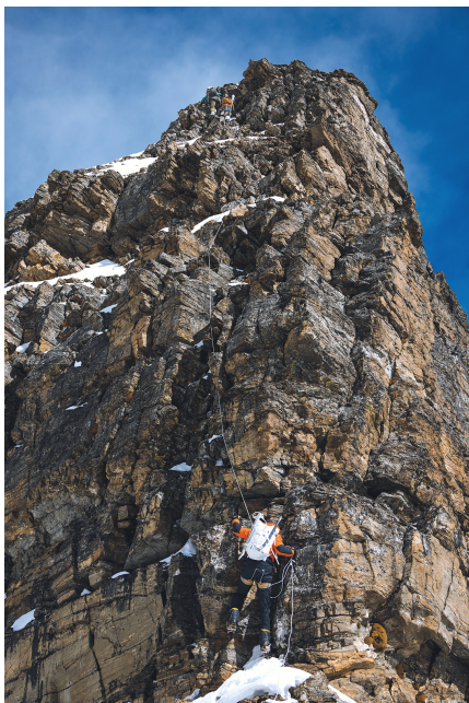
Climbing on the southwest ridge of Peak 5,608m.