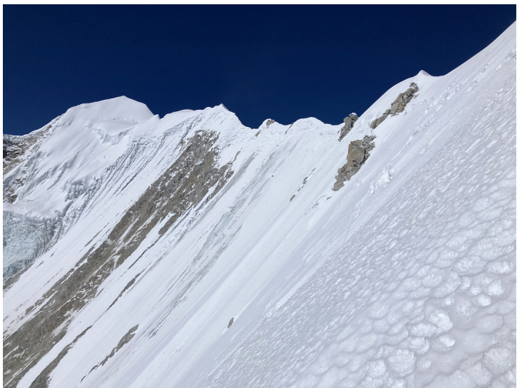
Approaching the sharp east ridge of Hongku. The summit visible at the left end is Junction Peak.