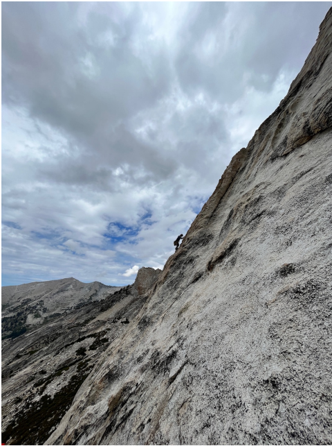
Silhouetted against gathering storm clouds, Reuben Shelton leads the crux 5.10 pillar on pitch six of Prism Break (7 pitches, 5.10), the Prism, Sequoia National Park.