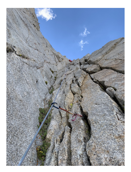
Vitaliy Musiyenko looking down from the top of the "fun part" on pitch three of Smooth Talkin' Sociopath (1,000', 6 pitches, III 5.10c), northeast face of Mt. Francis Farquhar, Kings Canyon National Park, California.