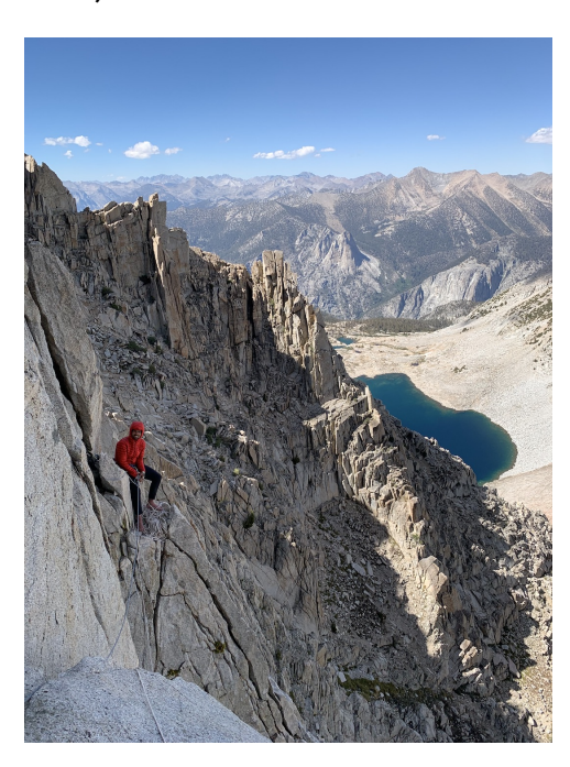
Vitaliy Musiyenko belaying the beginning of pitch four on Smooth Talkin' Sociopath (1,000', 6 pitches, III 5.10c).