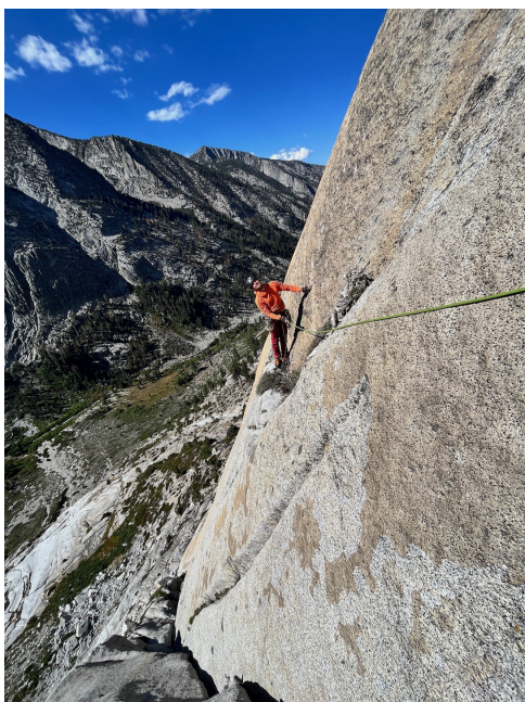
Brandon Thau scouting thin seams on pitch three of Knights Errant (6 pitches, 5.10+), on Lower Castle Dome, Kings Canyon National Park, Sierra Nevada.