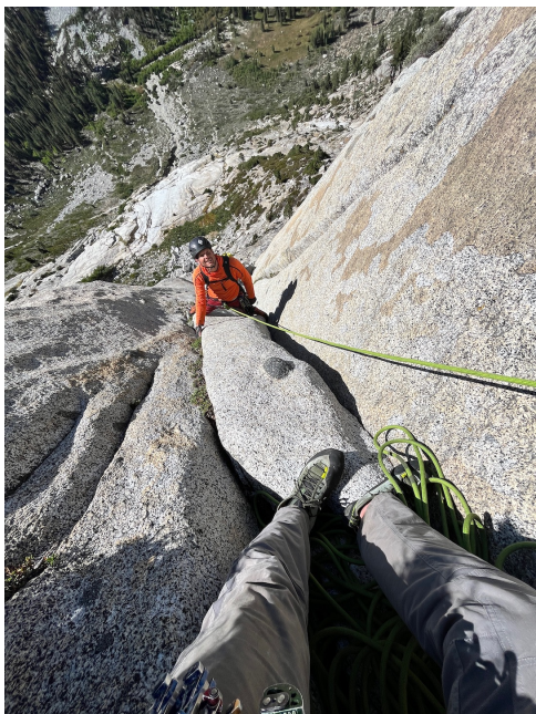
Brandon Thau following Dave Nettle's lead on pitch two of Knights Errant (6 pitches, 5.10+), on Lower Castle Dome, Kings Canyon National Park, Sierra Nevada.