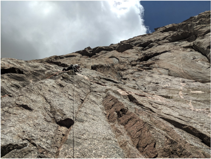
John Ebers bolting pitch six (5.12+) of Airiana Grande (13 pitches, 5.13 R).