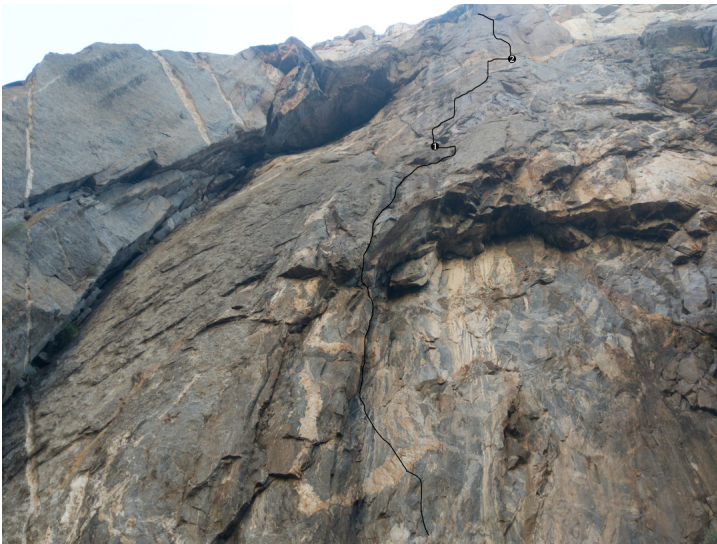
The black line shows the first two pitches of Airiana Grande (13 pitches, 5.13 R).