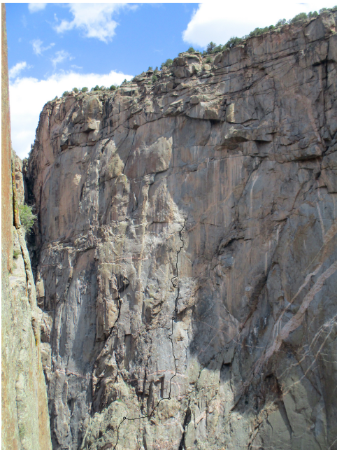
Pitches 5-8 of Airiana Grande (13 pitches, 5.13 R).