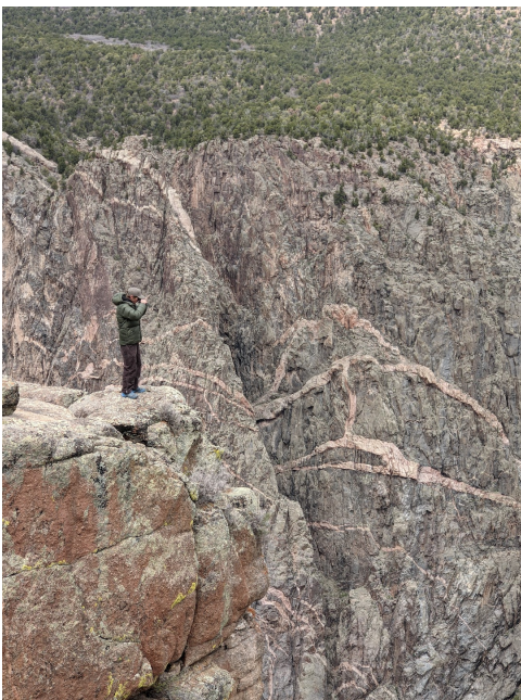
Cody Scarpella scoping out the North Chasm View Wall from the South Rim of the Black Canyon.