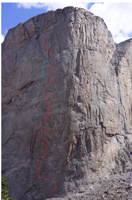
All Hooked Up on the north face of Mt. Hooker in Wyoming's Wind River Range. The blue line indicates the Left Hook variation.