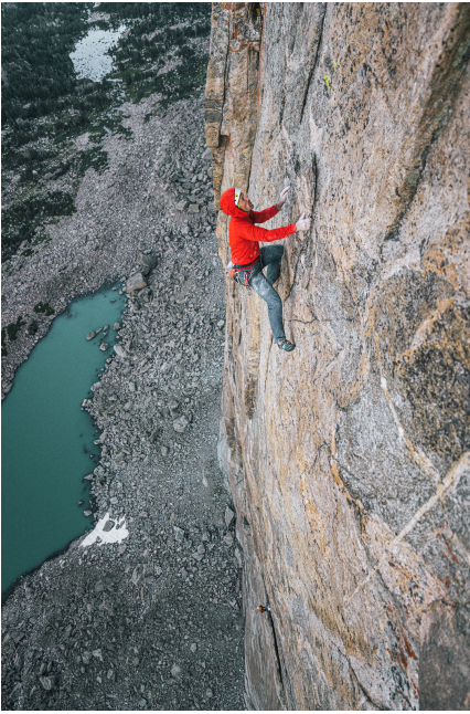
Jesse Huey near the top of pitch nine (5.12+) of All Hooked Up on Mt. Hooker.