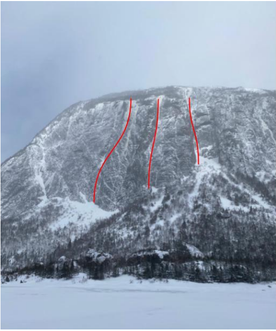
The Inner Sanctum lies at the back of Parsons Inner Pond. From left to right: Haywire (260m, WI5), Spindrift Highway (230m, WI4+), and Four Horsemen of the Apocalypse (230m, WI5+).