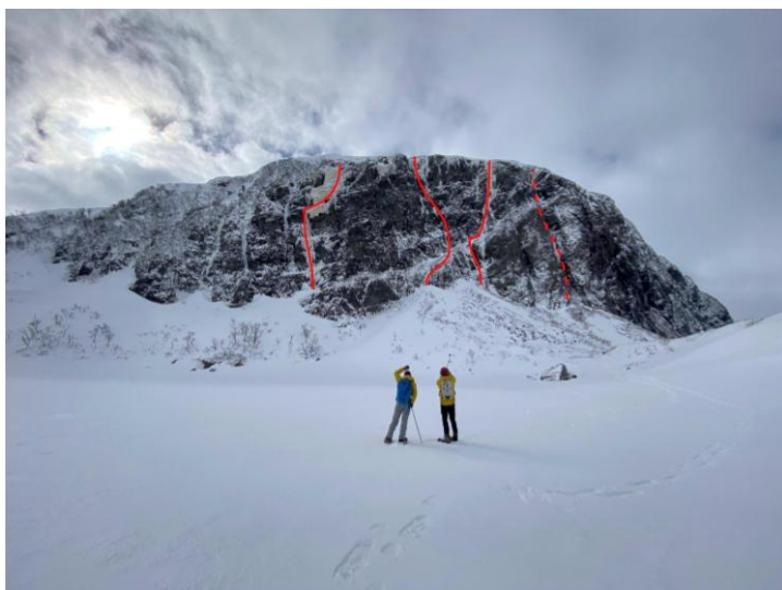
Route lines on the Wayback Wall, left to right: White Rabbit, (100m, WI5+), Whiskey and Weed (140m, WI5 M5), Dead Reckoning (140m, WI5), and God's Own Prototype (130m, WI5).