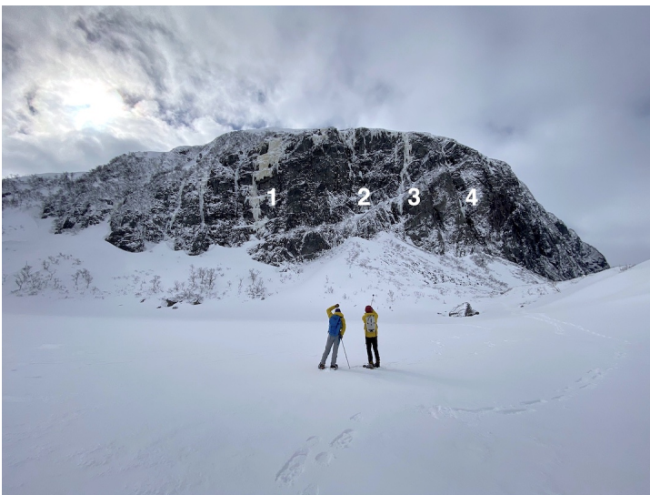
The north-facing Wayback Wall sits above a col at the back of Western Brook Gulch. The routes are (1) White Rabbit, (100m, WI5+), (2) Whiskey and Weed (140m, WI5 M5), (3) Dead Reckoning (140m, WI5), and (4) God's Own Prototype (130m, WI5).