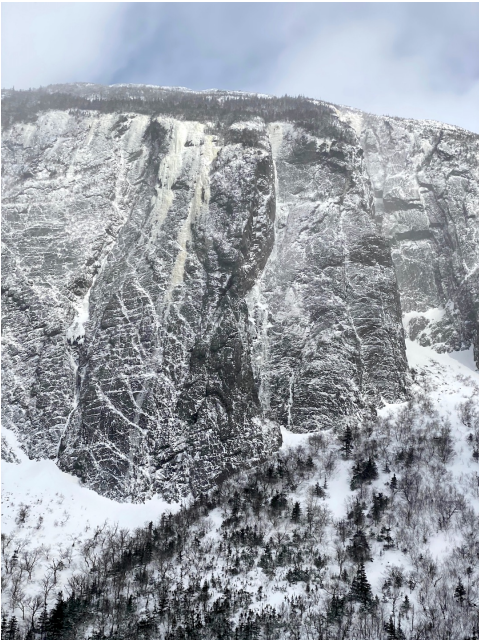
The Inner Sanctum Wall at the back of Parsons Inner Pond. Haywire (260m, WI5) finishes on the obvious steep ice in center left. Spindrift Highway (230m, WI4+) takes the corner in the center of the photo.