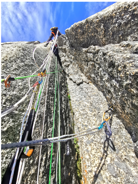
Complex ropework on the first ascent of Imaqa, west face of Nalumasortoq.