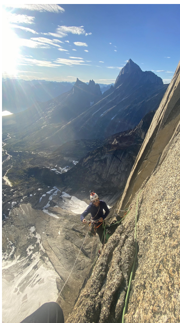
High on the west face of Nalumasortoq with the pyramid of Ketil behind.