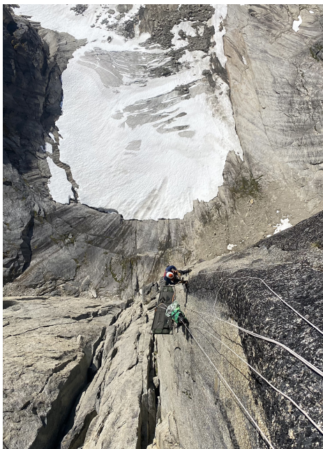
High on the cracks of Imaqa, west face of Nalumasortoq.