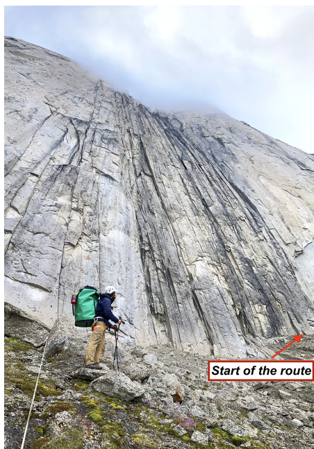
Approaching the west face of Nalumasortoq. The arrow marks the start of Imaqa.