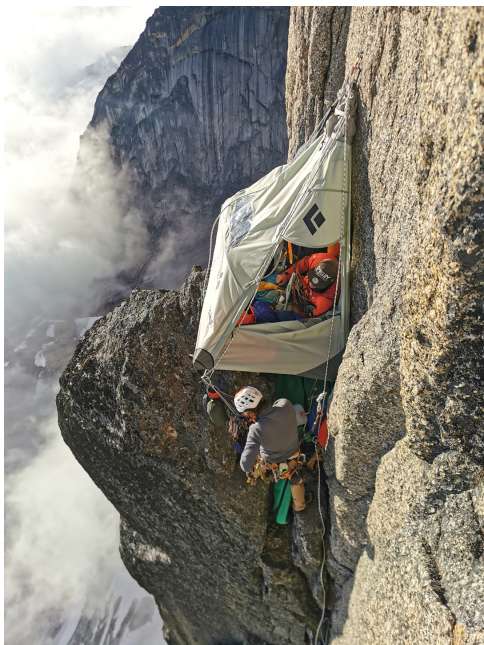
Portaledge camp on the west face of Nalumasortoq.