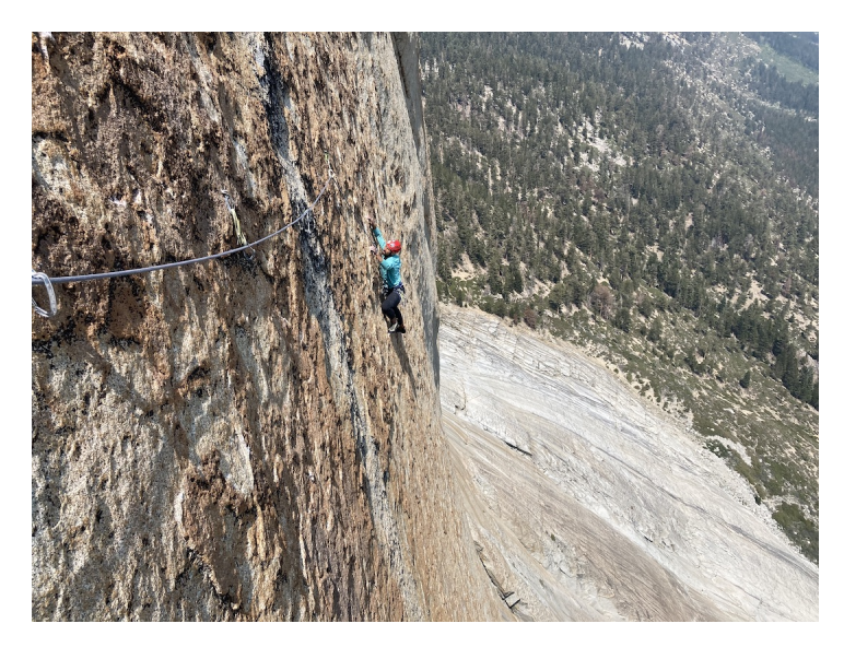
Vitaliy Musiyenko following the traversing finish of the sixth pitch of Against the Grain (1,800', 5.11c) on Charlotte Dome.