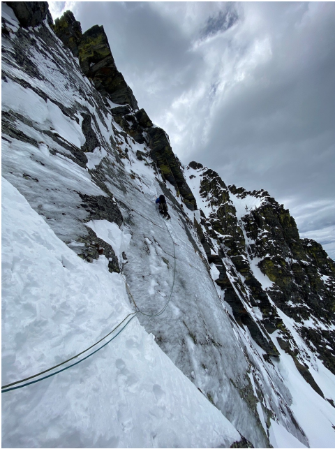
Earl Lunceford leading ice on pitch six of Knickerbocker and the Bull Moose on the north face of A Peak.