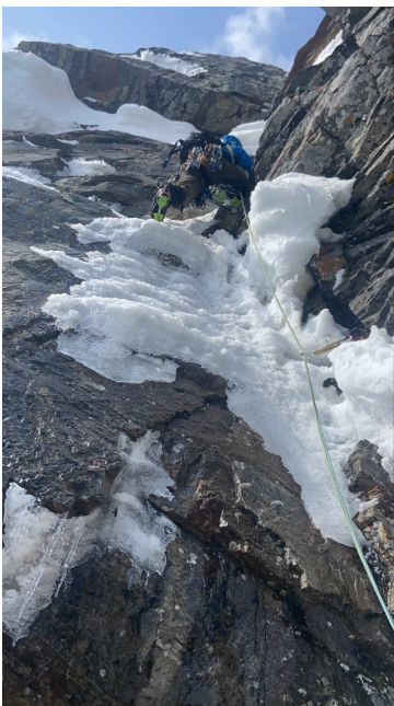
Earl Lunceford on the thin corner at the start of pitch three on Knickerbocker and the Bull Moose (2,000', IV AI4 M5), on the north face of A Peak (8,634'), Cabinet Mountains, Montana.