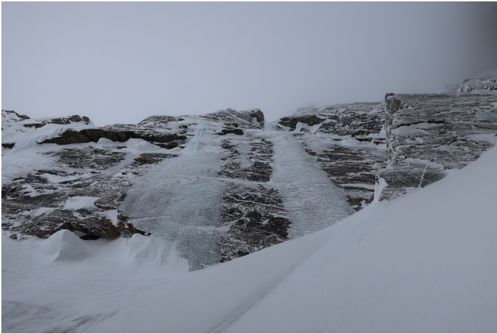
Looking up at the pinstripe ice flows on the north face of A Peak. The Bull River Prowler (AI4 M4 70°) ascends the right-hand flow.