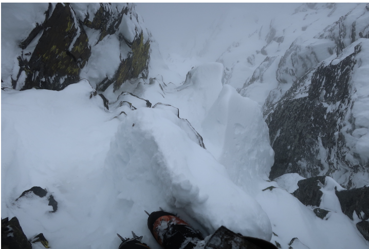
Looking down from a stance just below the summit-ridge cornice on the north face of A Peak, during the solo first ascent of The Bull River Prowler (AI4 M4 70°).