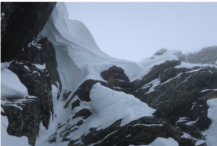
The cornice guarding the summit ridge of A Peak during the solo first ascent of The Bull River Prowler (AI4 M4 70°), Cabinet Mountains, Montana.