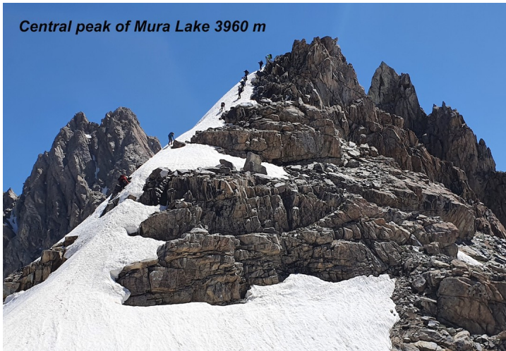
The final route to the summit of Central Mura in the Hissar Range.