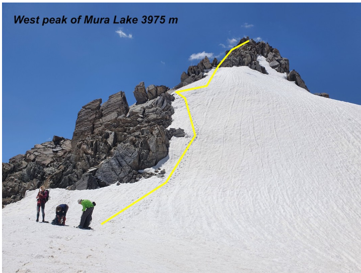
The final summit route on West Mura in the Hissar Range.