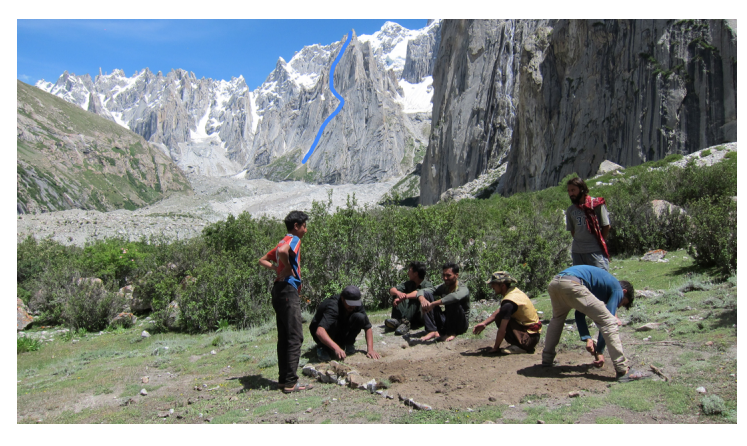
Approximate line of Asterisk, almost to the summit of Peak 5,007m (Peak 19, Wala map), seen from base camp in the Nangma Valley.