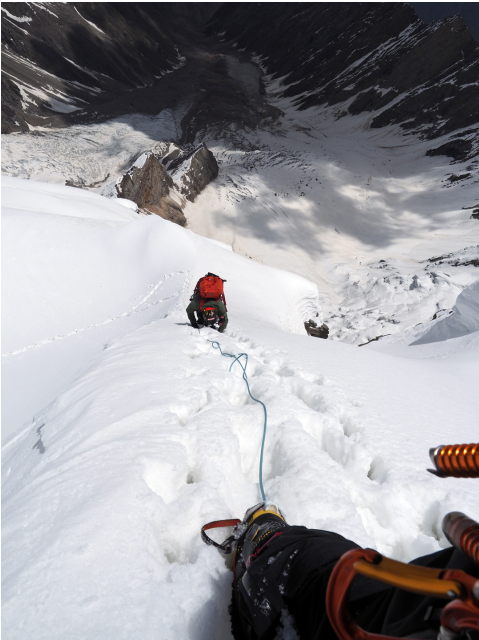
At around 5,500m on the northeast spur of Bondit Peak. The crevassed approach glacier can be seen at top left.