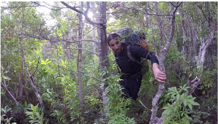
Bushwhacking through the dense forest en route to Cerro San Luis; it took eight hours to travel 5km.