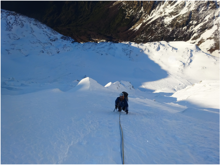
Making good progress on the snow ramp on the south face of Cerro San Luis.