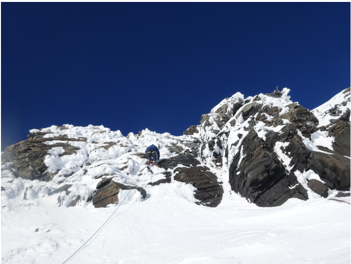
Leading mixed ground near the top of Cerro San Luis.