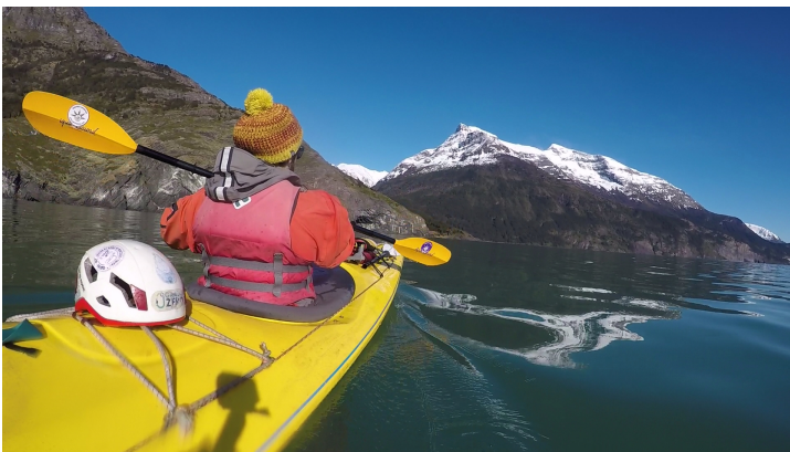
Kayaking west across Fiordo Última Esperanza to reach Cerro San Luis.