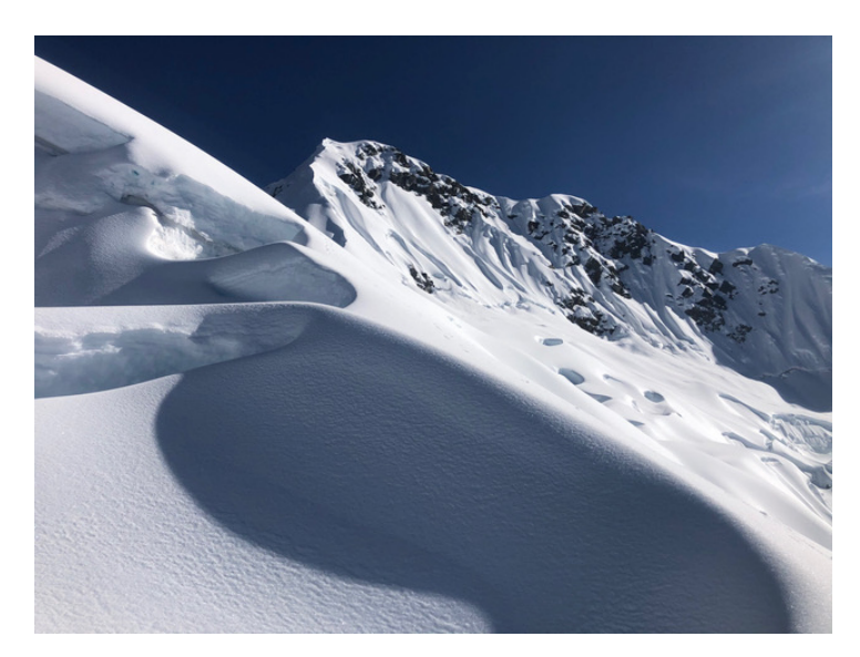
The final ridge crest of Chaupimayu (5,330m) in Cordillera Vilcabamba.