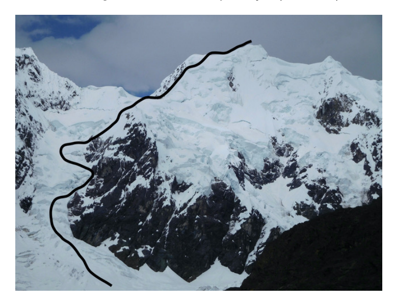
Callangate (6,110m) in the Cordillera Vilcanota showing the 2021 route, which is similar to that of the 1960s first ascent, ascending a glacial ramp on the northwest face to the northwest shoulder and finishing on the north ridge.