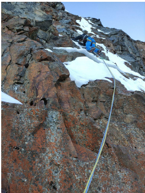
The beginning of the second pitch (M5+) of Polacos Banditos (500m, TD+ M6+) on the southwest face of Churup Oeste.