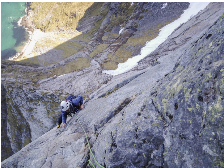
Jordi Esteve completing the run-out seventh pitch of Nordside on Ytre Brasrastindan.