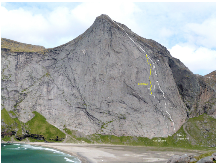
The west face of Helvetestinden above Bunes Beach, showing Rett Opp (yellow), climbed in 2022, and the two earlier routes with which it shares some pitches. Other routes are not shown.