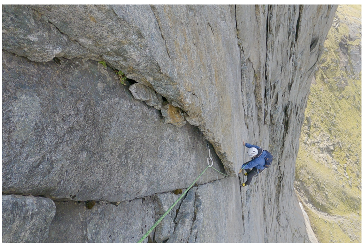
Jordi Esteve following pitch 10 of Rett Opp on the west face of Helvetestinden.