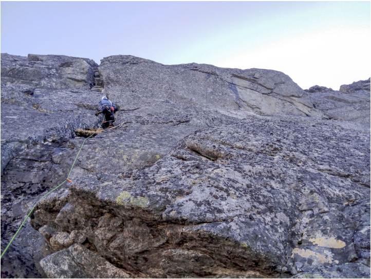
Jordi Esteve working up pitch 19 of Nordside on Ytre Brasrastindan.