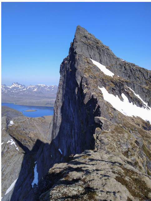
Brasrastindan from the west, seen from the ridge connecting to Ytre Brasrastindan.