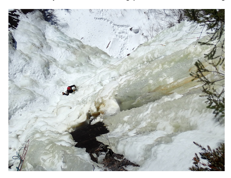
Patrice Beaudet leading up Passion Hivernal (65m, WI4+) in the Hautes-Gorges-de-la-Rivière-Malbaie.