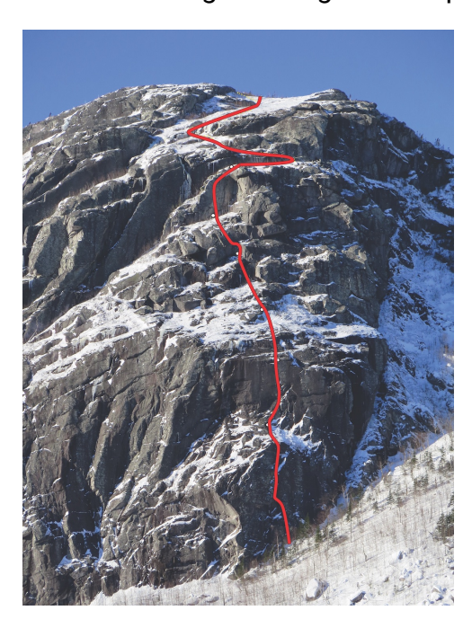
The north face of Gros Bras in the Grands-Jardins, showing Baba Yaga.